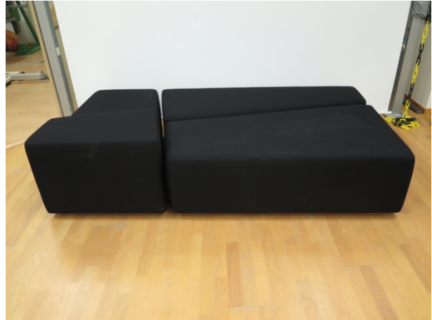
Figure 3 Without screen