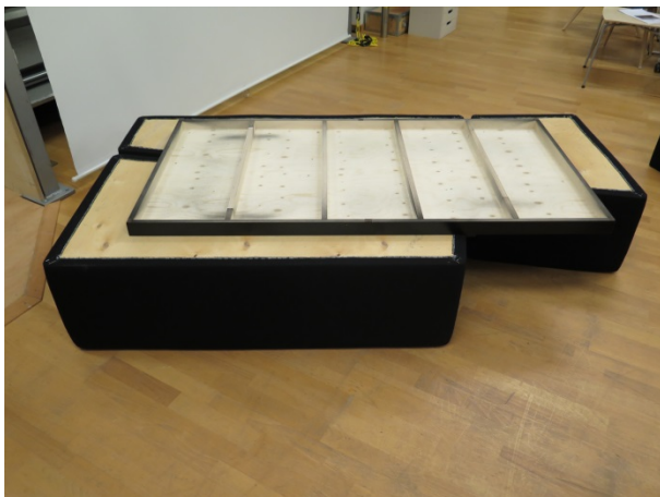
Figure 4 Underneath