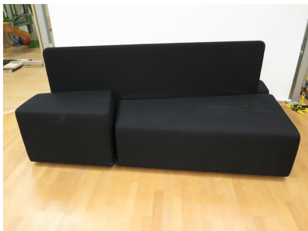
Figure 1 Diagonal sofa

Dimension: H=86 cm (with screen), W=202 cm, D=113 cm Seat height: 41 cm 3 elements, 51 cm 1 element Frame: Each element is a box of plywood with padding and covered with fabrics Base: Plywood, height 50 mm Screen: Board of wood, padding, covered with fabrics, mass 23 kg Other info: Mass of 4 elements and base=77 kg