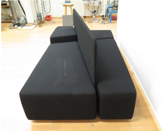
Figure 2 With screen